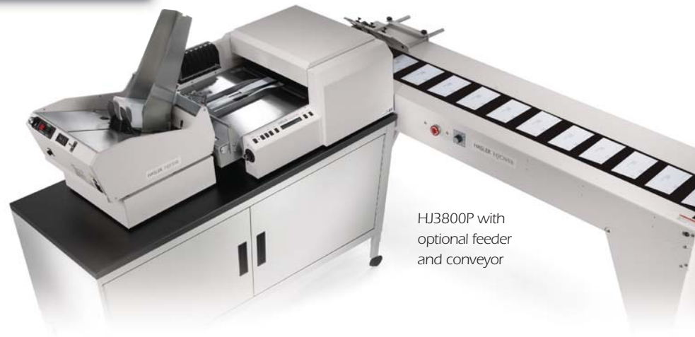
HJ3800P with optional feeder and conveyor